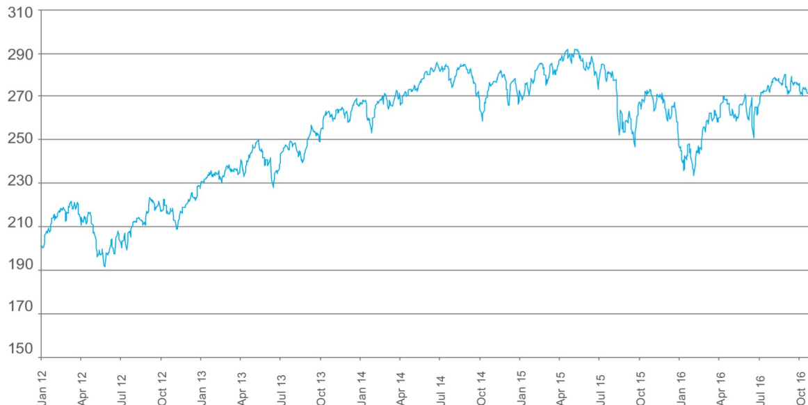
FTSE ALL WORLD $ - PRICE INDEX

As at 10 January 2017.